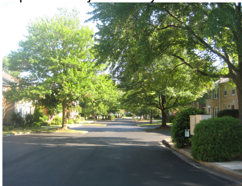
Leestone Ct looking fabulous!

We trust that the next paving project will operate very smoothly if all will adhere to these rules.